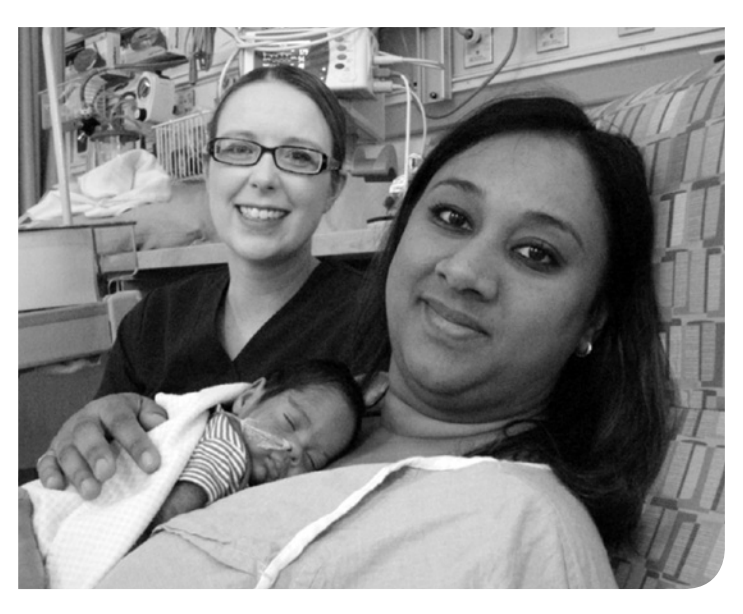
Supporting culturally competent care in the NICU

Cultural competence in healthcare tailors delivery to meet patients' social, cultural, and linguistic needs. Culturally com-