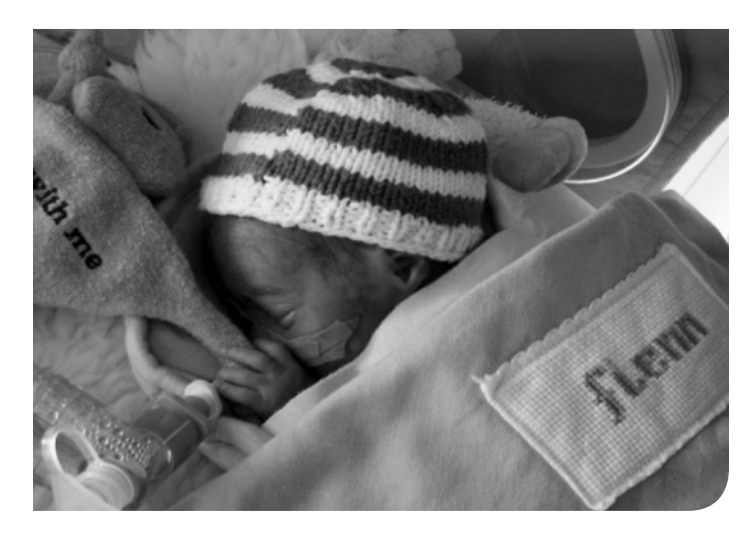
Erasmus MC-Sophia Children's Hospital, Rotterdam, The Netherlands

This has been an exciting year for NNCP. Significant progress has been made, and interest has developed, as nurseries around the world have taken the initiative to embark upon the process of NIDCAP Nursery Certification. A short description of applicant progress and increased interest in this learning and evaluation process is provided below.