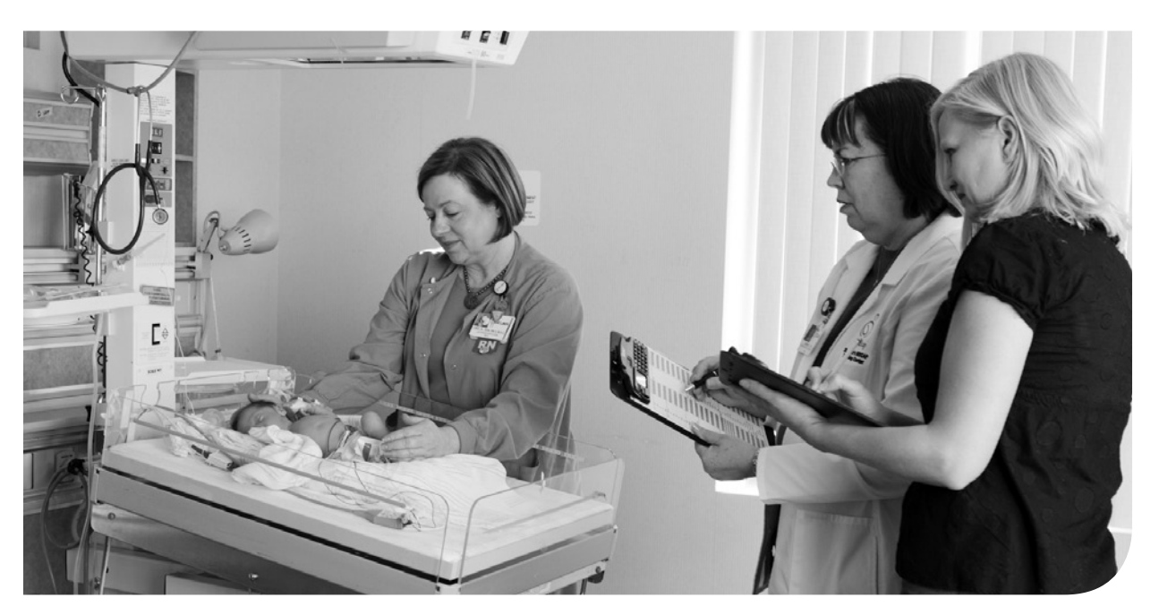
Learning to recognize the infant's voice and opportunities for support