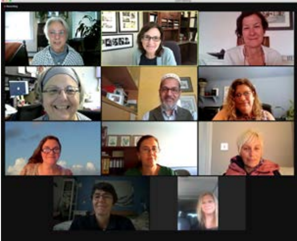
NFI FY 2020-21 Board Members & Executive Council