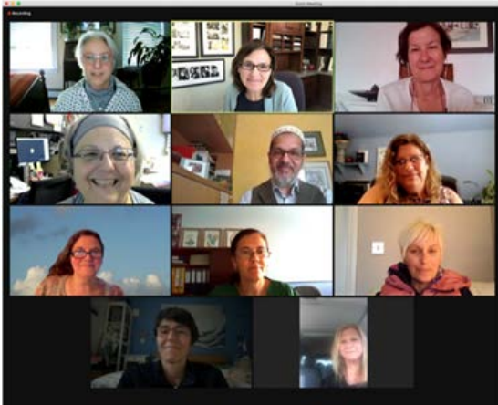
NFI FY 2021-22 Board Members & Executive Council