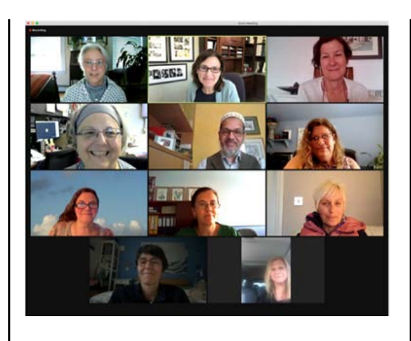
NFI FY 2021-22 Board Members & Executive Council