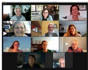
NFI FY 2020-21 Board Members & Executive Council