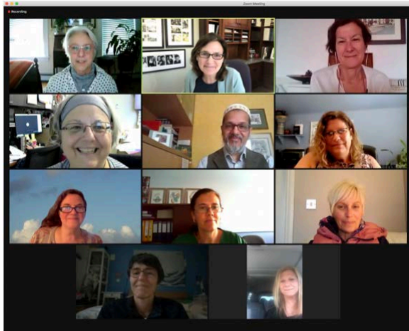
NFI FY 2020-21 Board Members & Executive Council