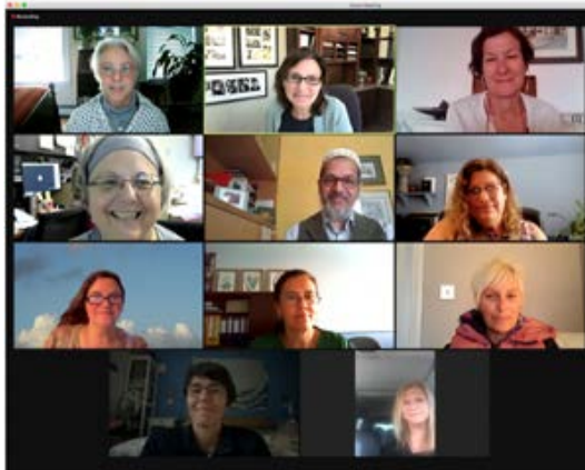
NFI FY 2021-22 Board Members & Executive Council