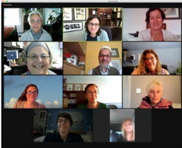
NFI FY 2021-22 Board Members & Executive Council