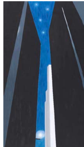
Georgia O'Keeffe Untitled (City Night), 1970s

O'Keeffe said "one can't paint New York as it is, but rather how it is felt." Her "feelings" about skyscrapers evolved, as expressed by her paintings. O'Keeffe's body of work has a lasting endurance. Learning, inspiration, creativity,