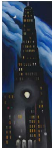
Georgia O'Keeffe Ritz Tower, 1928

The New Year offers opportunities for new perspectives. I have been thinking about this idea as 2022 came to a close and now 2023 has begun. Last week, I visited the Georgia O'Keeffe Museum in Santa Fe, New Mexico, USA. One particularly fascinating set of paintings by O'Keeffe were done of New York skyscrapers nearly 50 years apart. In the intervening years, O'Keeffe had moved to New Mexico where among other subjects, she painted majestic canyon landscapes. Applying her years of painting deserts (and flowers and skulls), O'Keeffe returned to her earlier New York City subject and uniquely applied a canyon perspective to her cityscape composition.