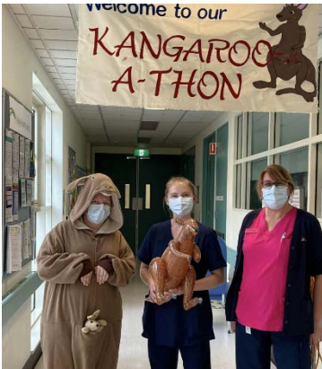
Grace Centre for Newborn Care at The Children's Hospital, Australia