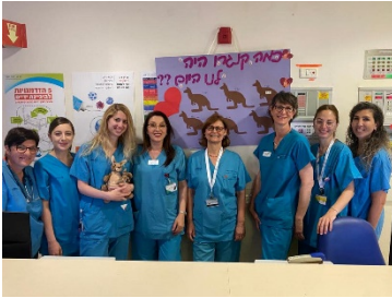
Meir Medical Center, Israel