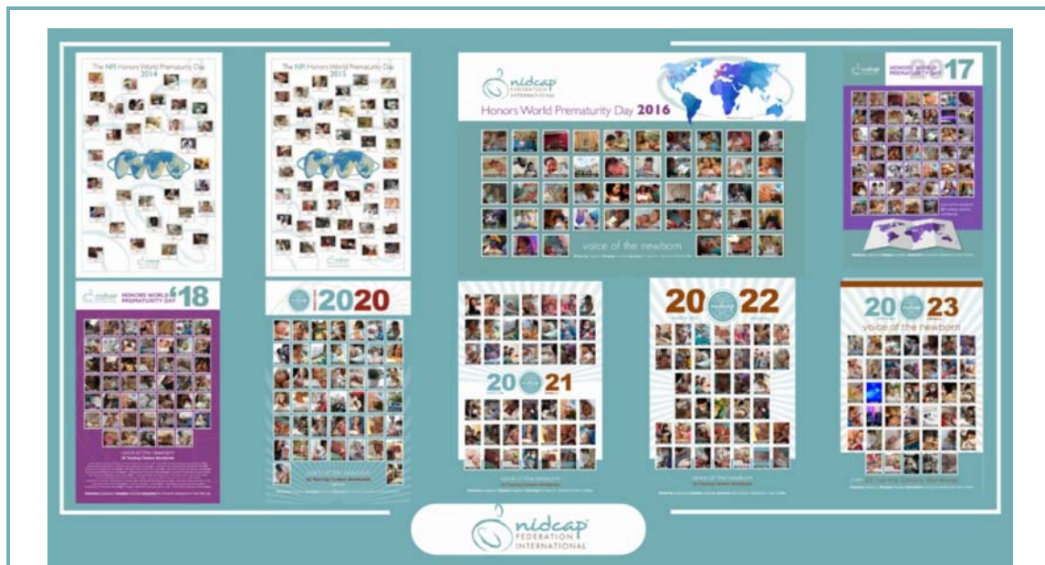
World Prematurity Day and NIDCAP Day Posters 2014 - 2023